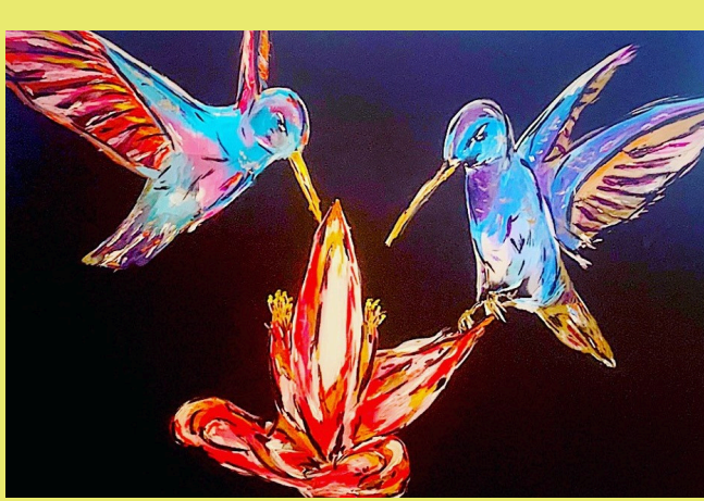
"SHVESS-fair aka Sisters"